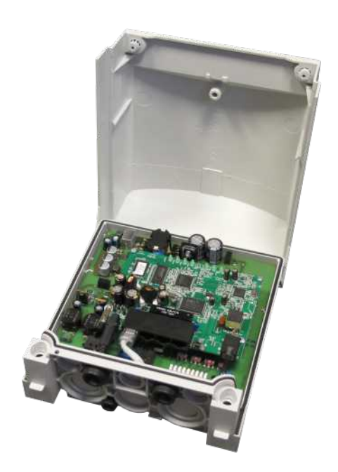
Figure 2. – DataPowerBoost

If one power pair is enough for DataPowerBoost, the Exchange installed RPF can connect 4 outdoor units with power and data: the RPF card is ready to combine the xDSL signal to both its power link.